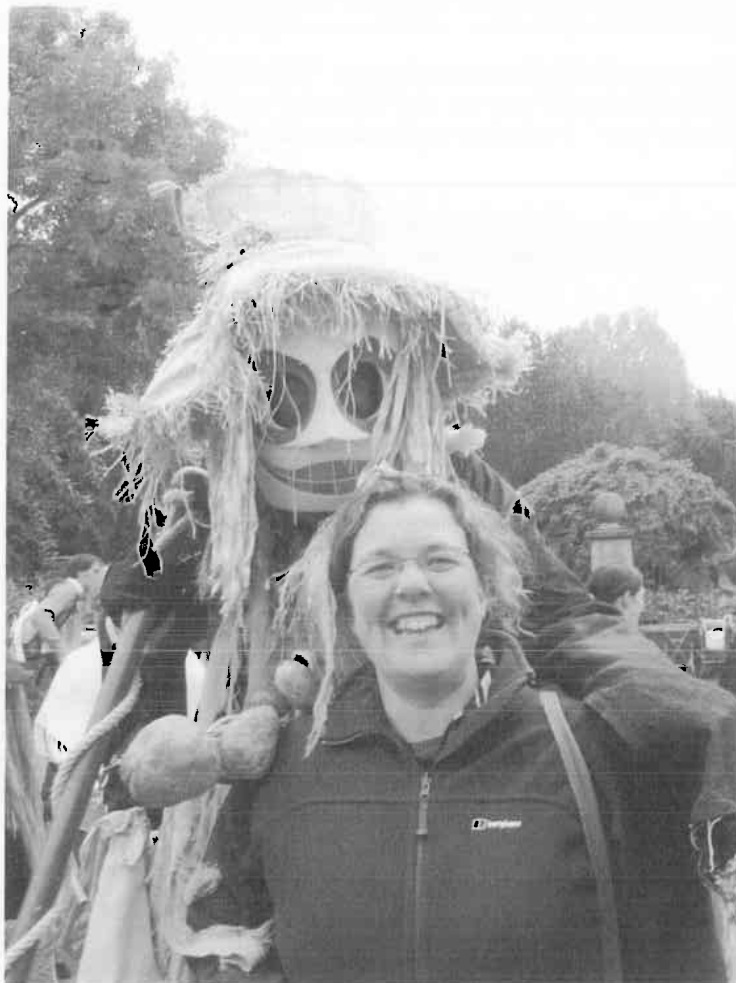
An entry for the Scarecrow competition – the Scarecrow is the one at the back!